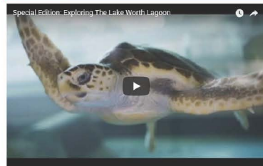
Special Edition: Exploring The Lake Worth Lagoon